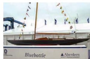
Bluebottle at AAM Cowes Week 2011