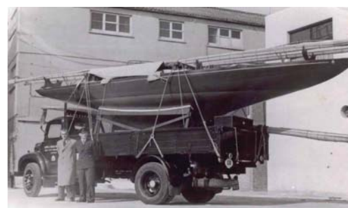
Bluebottle being transported in the approved manner in the 1950s

Donations can be made directly to the BDA Treasurer, who will forward them to the NMMC.