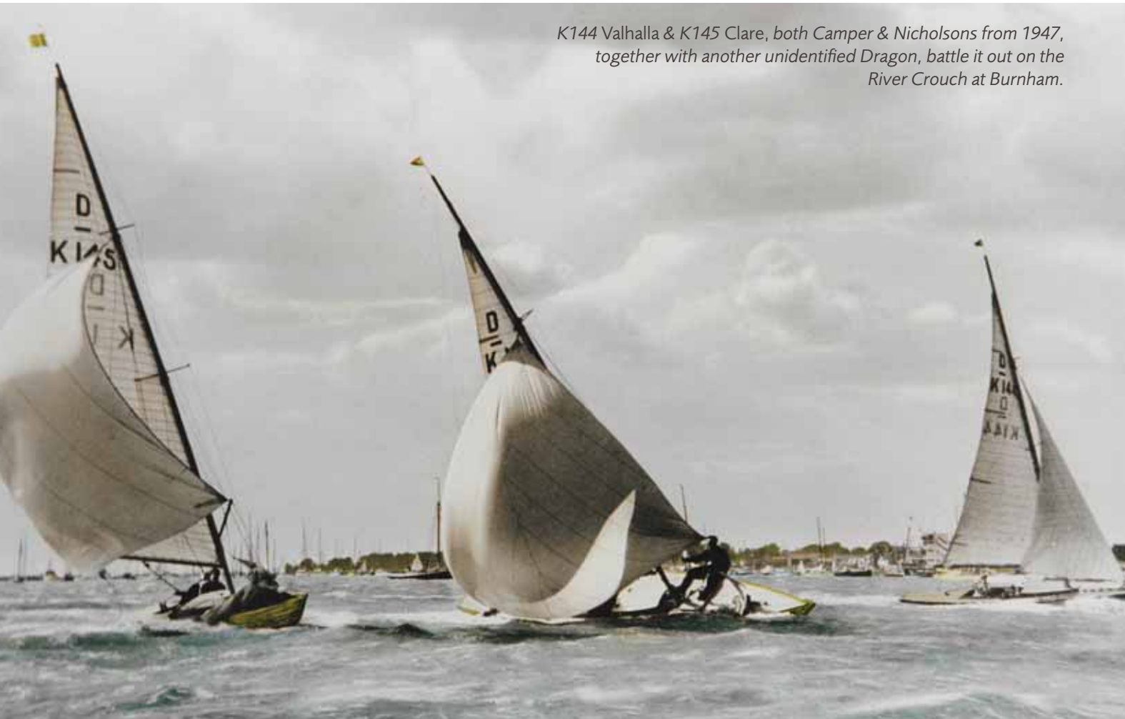
K144 Valhalla & K145 Clare, both Camper & Nicholson's from 1947, together with another unidentified Dragon, battle it out on the River Crouch at Burnham.